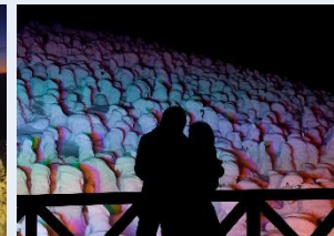
A couple enjoying the Juhyo