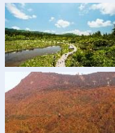
Trekking and autumn leaves

The “Zao Onsen Large Open-air Bath” is located in Zao, where people can enjoy a bath surrounded by nature, with water directly drawn from the spring source. The bath is open only from April to November. Situated besides a stream, hearing the sound of the stream while bathing is a gorgeous and mystical experience. Furthermore, the nature is rich and full of attractions throughout the year. In the summer, people can enjoy trekking, and autumn is the peak season for the leaves changing color.