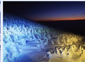
Juhyo lit up