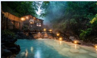
Zao Onsen Large Open-air Bath