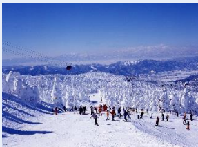
Zao Onsen Ski Resort

Zao Ropeway : http://zaoropeway.co.jp/en/index.html