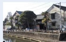
[Yokoyama Local Culture Hall]

Get your One-Day Citizen Passport at the Tourist Information Center to the right after exiting the ticket barrier and start exploring!!