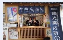
[Tochigi Station Tourist Information Center]

Get your One-Day Citizen Passport at the Tourist Information Center to the right after exiting the ticket barrier and start exploring!!