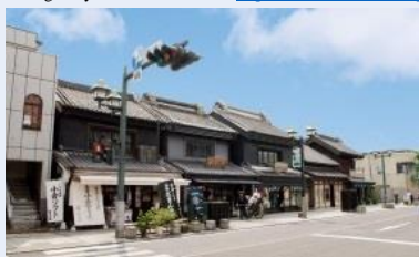
[Warehouse ]

So many perks with the One-Day Citizen Passport!