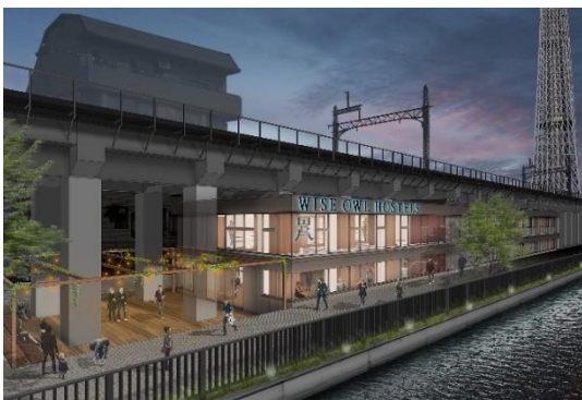
▲ Exterior of the hostel (conceptual image)