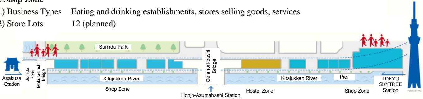
▲ Zone Layout (conceptual image)