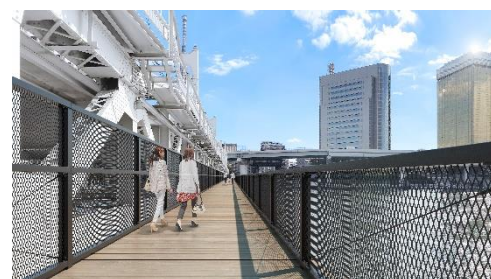
▲ Newly constructed footbridge spanning the Sumida River (conceptual image)