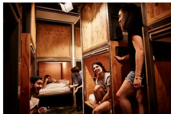
▲ Guest room of an existing hostel operated by Wise Owl (reference)