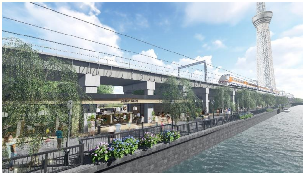
▲ Commercial facility as seen from the Kitajukken River (conceptual image)