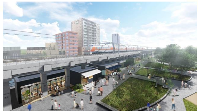
▲ Commercial facility as seen from Sumida Park (conceptual image)