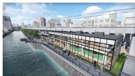
△ Commercial facility facing Asakusa (conceptual illustration)