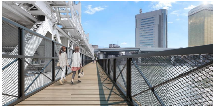
△ Sumida River Walk (conceptual illustration)

* See the News Release dated June 25, 2019 “ Tobu to Improve Area Foot Traffic by Connecting Asakusa and Tokyo Skytree Town® ” and “ Tobu to Open Complex under Elevated Railway Tracks Connecting Asakusa with Tokyo Skytree Town® in Spring 2020! ” for more details of the prosperous waterside development connecting Asakusa and Tokyo Skytree Town, and the complex under the elevated railway tracks.