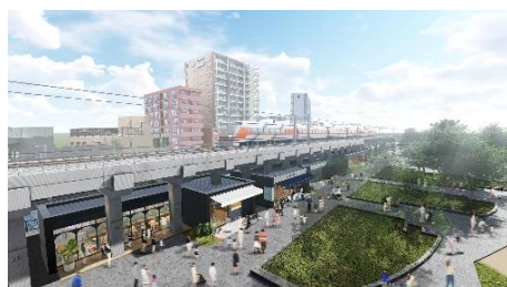
△ Commercial facility as seen from Sumida Park (conceptual illustration)

The development of a waterside space acting as a destination where visitors coming and going encounter a downtown charm closely tied with the community.