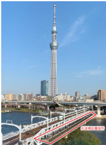
△Construction location seen from the Asakusa side (conceptual illustration)