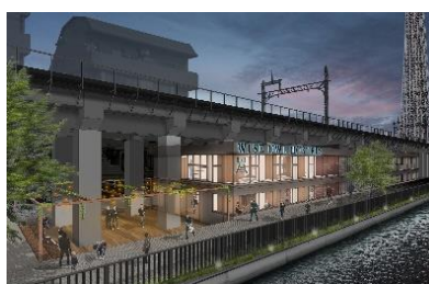
△ Exterior of the hostel (conceptual illustration)