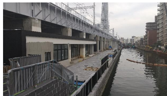
△ The construction underway (left: Sumida Park; right: Shinsui Terrace)