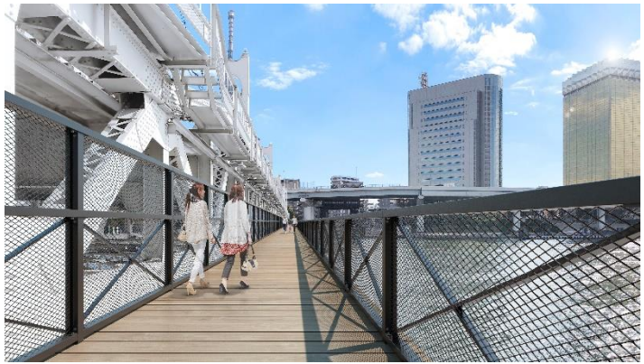
SUMIDA RIVER WALK (conceptual image)