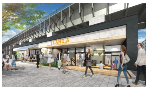
△ LAND_A (conceptual image)

Tobu Railway will strive continuously to make the area the leading tourist location in Tokyo while cooperating in the Kitajukken River and Sumida Park Circular Sightseeing Path development project promoted by Sumida Ward. Further details are provided in the attachment.