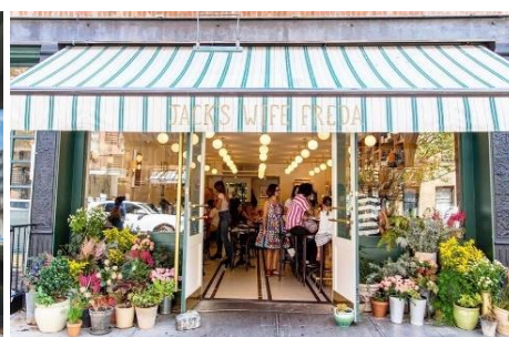
△ Jack's Wife Freda (conceptual image)