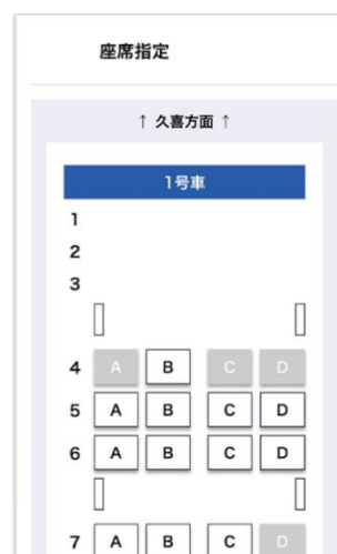
Screen to reserve seat and train car No.]