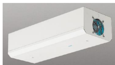
[Ultraviolet Air Sterilizers]