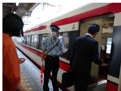
[Masks and face shields]