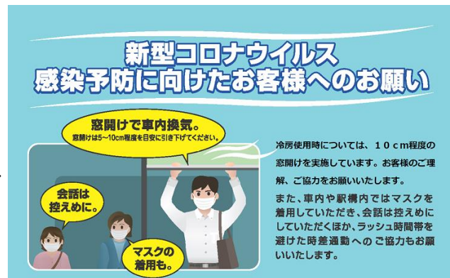
[Requests to customers to prevent infection (poster)]