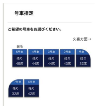
[Internet purchase and reservation service

Customers can check seat availability when purchasing tickets and making reservations through express ticket vending machines and online purchase and reservation services.