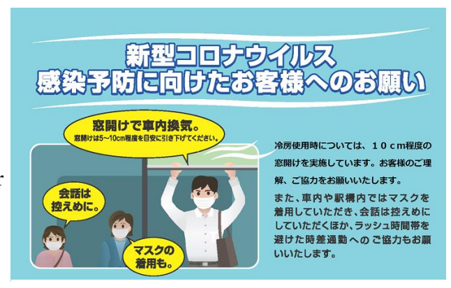
[Requests to customers to prevent infection (poster)]