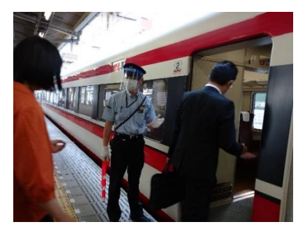
[Masks and face shields]