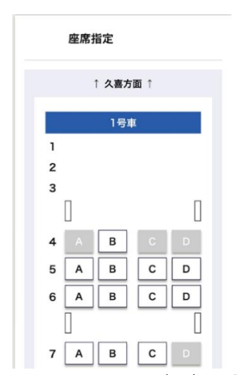
[Internet purchase and reservation service