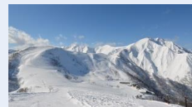
Tenjindaira Ski Resort, Tanigawadake