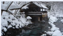
Mixed outdoor bath (winter)