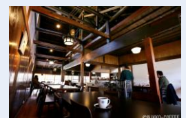
Nikko Coffee Goyoteidori