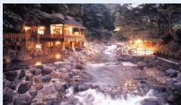
Mixed outdoor bath