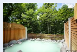
The 'Soraburo' Outdoor bath