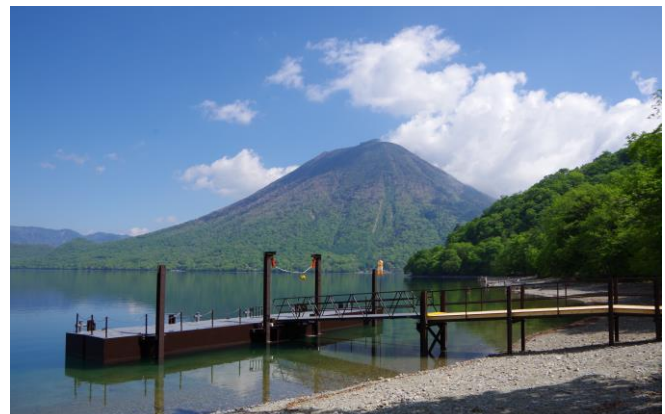
△Full view of the new pier Embassy Villa Memorial Parks