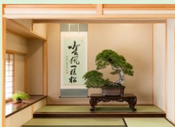
Zashiki-kazari (A decorative feature in a Japanese style room): The Gyo Style Room

• The Omiya Bonsai Art Museum, Saitama: https://www.bonsai-art-museum.jp/en/