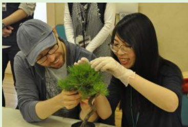
A Couple Happily Creating Bonsai Together