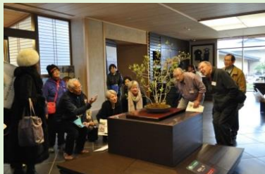
Guided Exhibition Tours

For more information, check out this link! https://www.bonsai-art-museum.jp/en/post-3784/