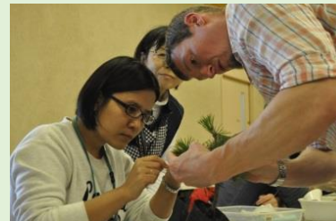
Bonsai Lessons from Instructors